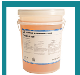
5-gallon pail SKU: E850/5 UPC-12: 641238066521