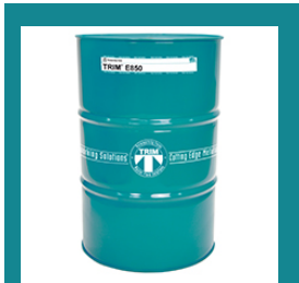
54-gallon drum SKU: E850/54 UPC-12: 641238066408