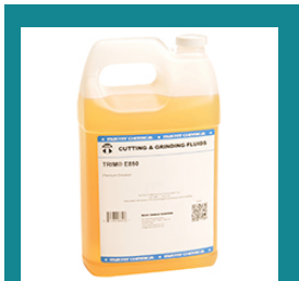
1-gallon jug SKU: E850/1 UPC-12: 641238066507