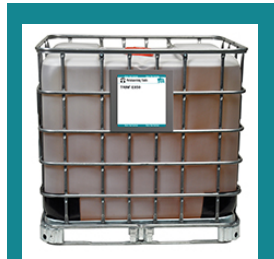
270-gallon tote SKU: E850/NR270P UPC-12: 641238066538

TRIM ® E850 | ©2009-2021 Master Fluid Solutions ® | 2021-12-27