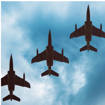
Performance soars with E850.